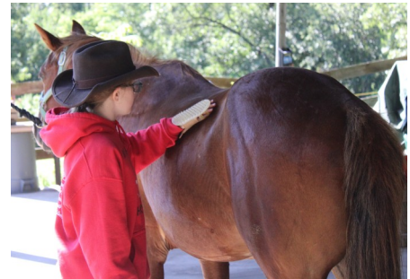
A camper grooming a horse to begin lessons for the day