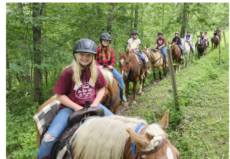
Camper trail rides!