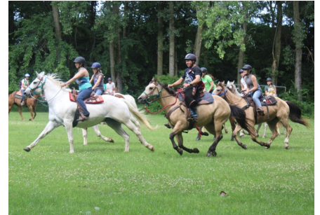
High school horse campers going for a ride on the recreation field

To help us best capitalize on this opportunity to further our mission, we will need your financial support as well as your input. To make a donation toward this new endeavor, you may go to https://campiodiseca.org/believe/ or mail in a check with the provided envelope. To view a more in-depth outline of our program plan, go to https://campiodiseca.org/new-horse-programming/ . At the bottom of this page, there will also be a five-minute survey for you to provide your input which will support us as well! Thank you for all of your support, and we look forward to a blessed 2025!