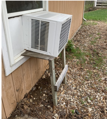
This could look better.

Several improvements have taken place across Camp over the winter season. We're excited for campers and guests to see them. Most notably, we've made several updates to the basement of the Omega Lodge. The two basement rooms have been repainted, have had new carpet tiles installed, and curtains have also been added. Thanks to the work of King of Kings Lutheran Church in Cedar Rapids, we have all new lights in the basement of Omega Lodge as well. They also took time to reroof and refloor the amphitheater shed, which was paid for thanks to the IED LWML grant. You can see these updates by taking a look at the pictures at the top of the next page!