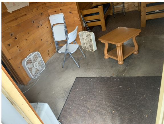
The cabins need a good cleanup!

Our next set of updates has to do with our Spring Cleanup day on May 4 and beyond. We look forward to having your help as we get ready for summer! Though some will be sad to see it go, we've now removed the wood burning stove in the Activity Hall of Alpha Lodge. While we're