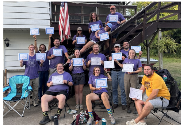
Camp staff with their awards at the end of summer.

Most years, our theme is learned with it simply being taught by our staff and pastors to our campers. For those of us behind-the-scenes at Camp, we learned the comfort of our theme first-hand this year, and it had so much more to do that with how it was answered, but rather knowing that in our moments of need that God is listening and attentive to us. When we had no idea how to staff the upcoming summer, there was no confidence other than that of having the ear of God who has promised to Hear Our Prayer , that we might ask him for our needs "as dear children ask their dear father." Our sights are now set to 2024 with the same prayer that God would continue to provide staff once again! The summer staff application process is open for the season, and we look forward to our 2024 summer under the theme: Immanuel—God With Us.