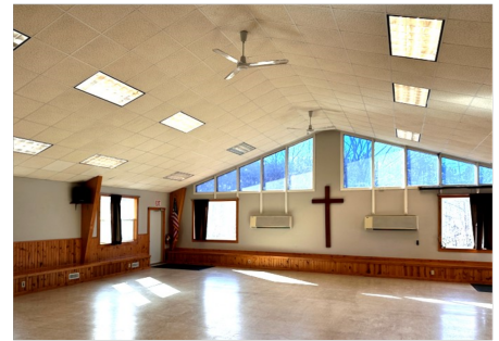
A newly painted dining/activity hall.

All this is to say it's been an expensive year, and with your support, we hope to close the gap of this years operating deficit. As of the end of October, we're trying to make up a $40,000 operating deficit for this year. While its not unusual for Camp to be making up an operating deficit at the end of the year, it would only normally be about 1/2 or 1/4 of that, which just goes to show how much inflation has impacted Camp Io-Dis-E-Ca this year. So while it's encouraging that Camp has been able to reach her revenue benchmarks, we need your help in keeping up with the costs as we close out 2023. Please consider blessing Camp Io-Dis-E-Ca this giving season in our efforts to ensure Camp stays safe, working, and beautiful! You can donate today by mailing in a check with the provided envelope or by donating online at https://campiodiseca.org/believe/ . Thank you for your support, and we look forward to a blessed 2024!