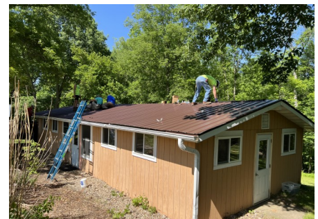
New roofs on Mary Cabin and the Campground Pavilion.